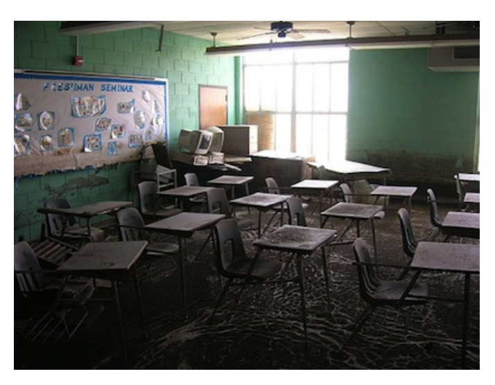
A school damaged by Hurricane Katrina.