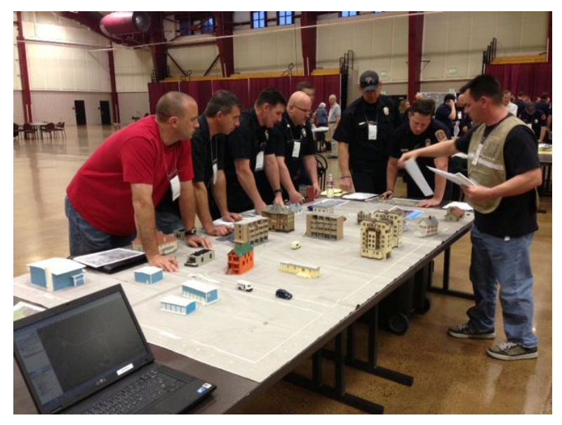
The Blue Cell, LLC Colorado based planning company tabletop planning exercise.