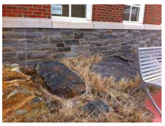
Tip 5: Is your school encouraging pests or molds?

Cracks and holes in foundations and exterior walls will permit pest entry.